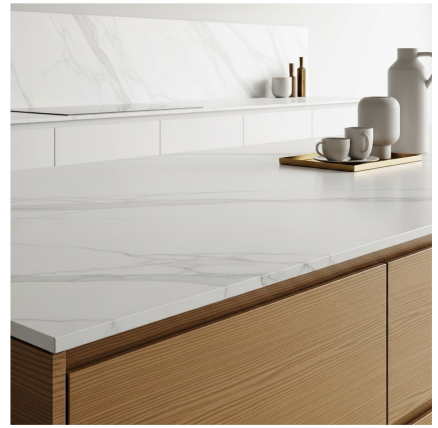
CERAMIC / MDI

Selected from our own stock yards. Honed, leathered or polished; edge profiles cut in-house.